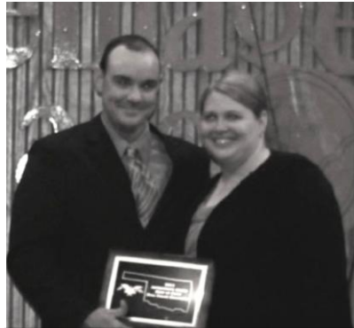
C.R. O'Hara Full Color Brochure