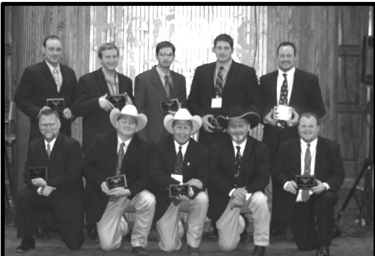
Top Ten Pro Bid Calling Contest